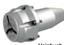
Hainbuch power chuck