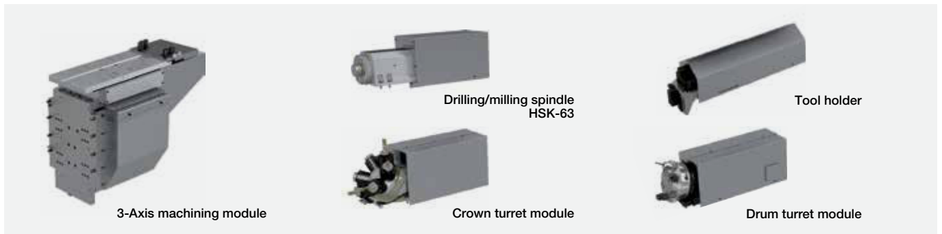
3-Axis machining module